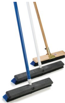
Omni Sweep® Floor Sweeps