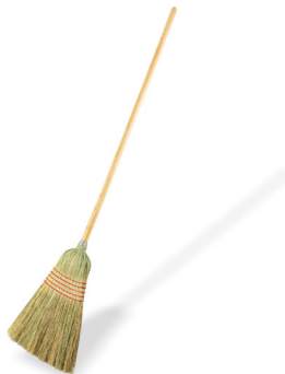
Corn & Upright Brooms