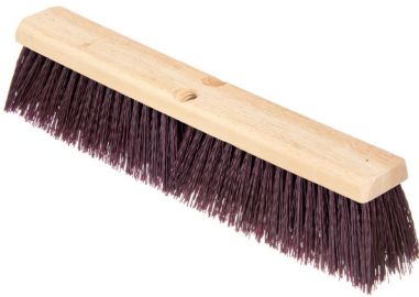
Flo-Pac® Coarse/Heavy Sweeps