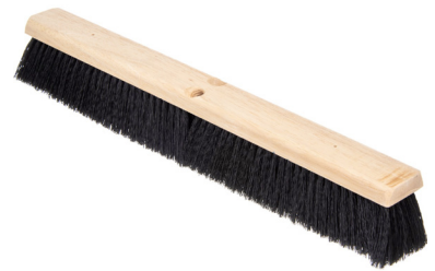
Flo-Pac® Fine/Medium Floor Sweeps