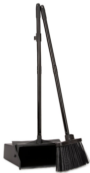
Dust & Lobby Pan Combos

Round out your floor care needs with our complete line of dry floor care solutions, including broom handles, Omni-Sweep, brushes, and dustpans. CFS Brands/Sparta is committed to helping you keep your facility clean, organized, and compliant.