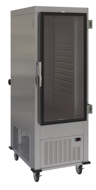
NSF/ANSI Standard 2