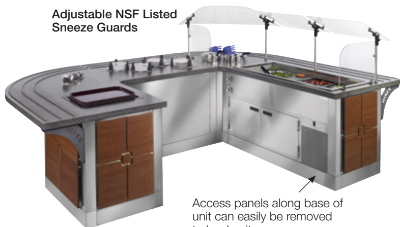
Adjustable NSF Listed Sneeze Guards

Access panels along base of unit can easily be removed to level unit.