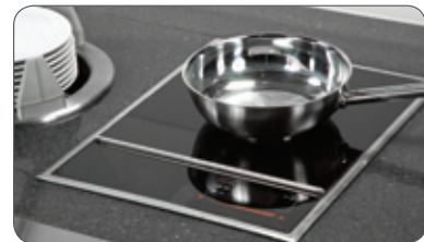
Optional Induction Counter Cooktop.

Stainless steel counter tops and panels are standard, but you can also choose from a virtually unlimited number of panel textures, countertop materials and accessories to create the look you want.