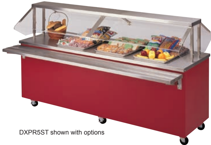
DXPR5ST shown with options