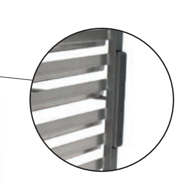
DXPUW6618 Shown with optional vertical corner bumpers

Dinex Universal Wide Angle Guide Rack Series DXPUW, is one of the most versatile types available for the storage and transport of various size pans. The all-welded, exclusively designed guides in this Series require no adjustment or removal in order to handle any depth food pans.